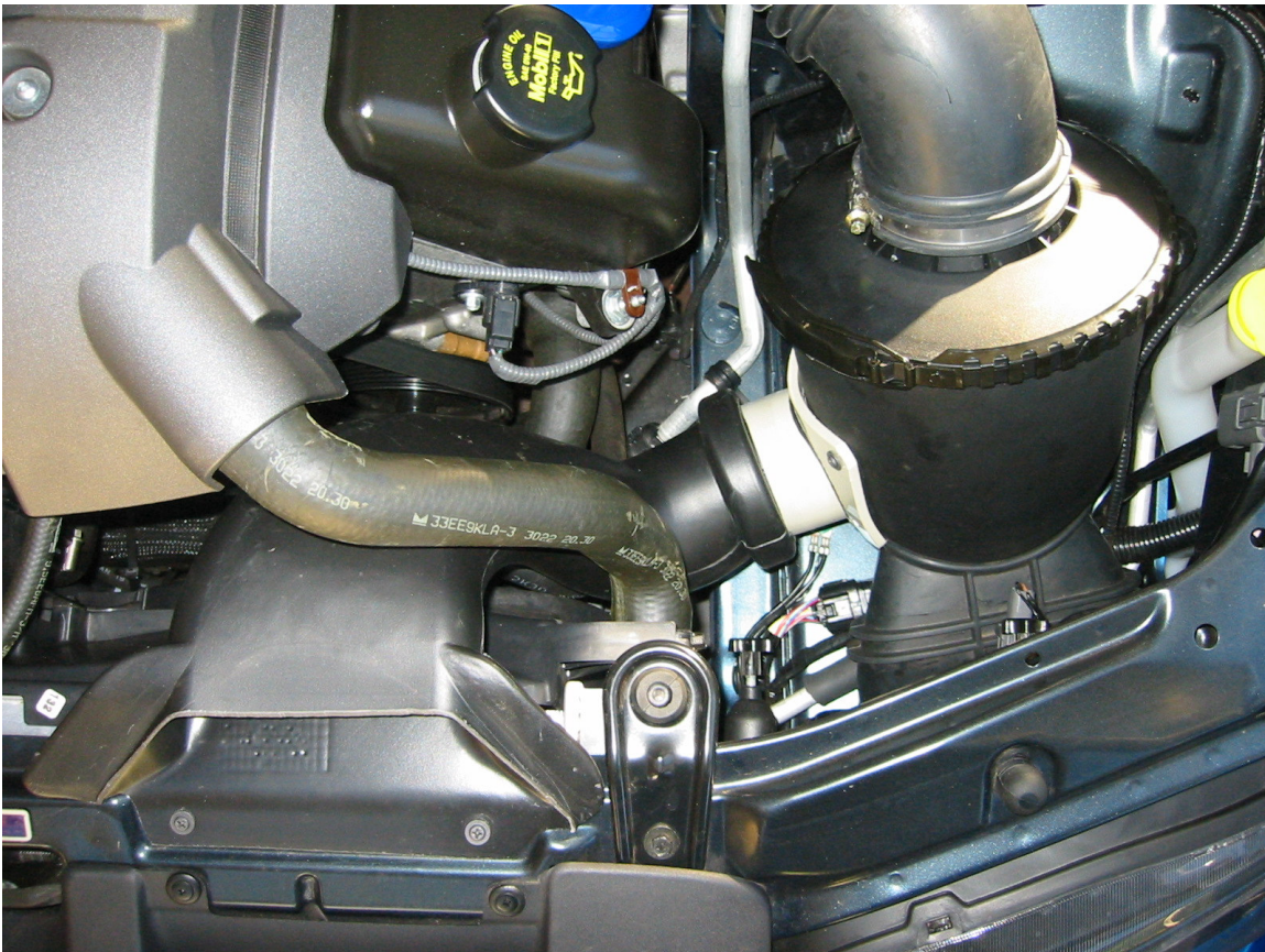
Completed Air Intake installation